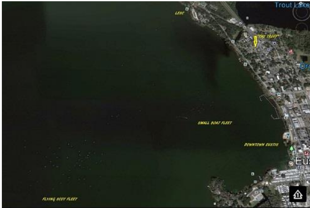
A nice view, from altitude, showing the whole area. The "small boat fleet" started before we did, and you can see them lining up along their start line. The Scots, San Juans, and Wayfarers are just milling around as the Race Committee begins to set the Scot course.