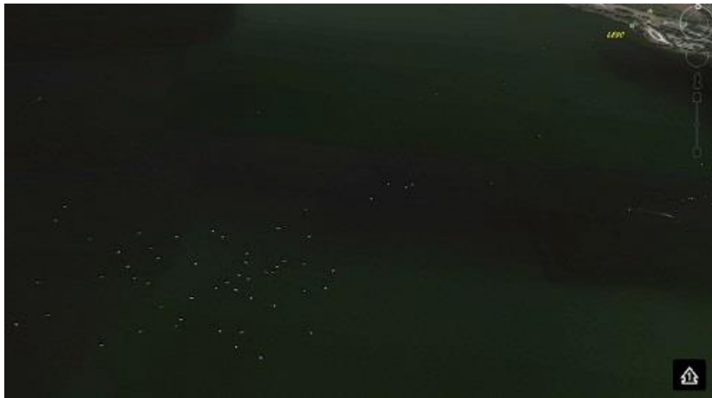
A little closer in, you can see the bee swarm of mostly Flying Scots. The Lake Eustis Sailing Club is in the upper right corner.